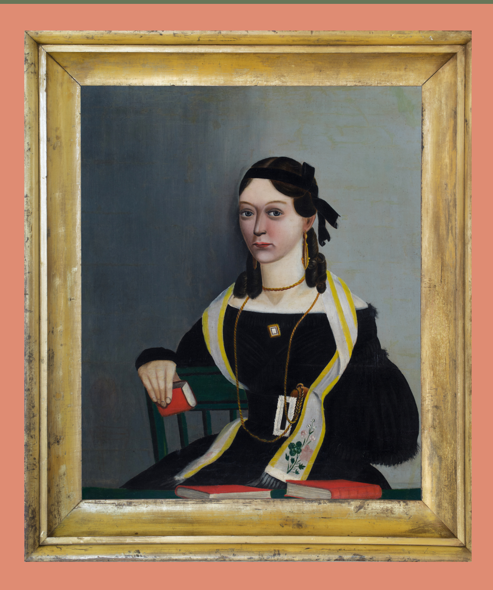
Portrait of a Baltimore young lady accompanied by the mother-of-pearl buckle shown in the painting, c.1830. oil on canvas 30 ½" × 24 ¼"