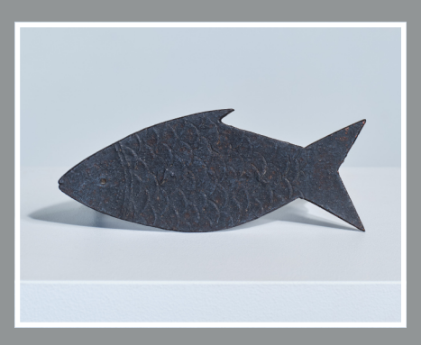
Iron axe holder in the shape of a fish with incised scales from a Conestoga wagon. Pennsylvania, early 19th c. L. 8 1/8"

Miniature iron spatula with heart cutout. Pennsylvania, early 19th c. L. 5 3%