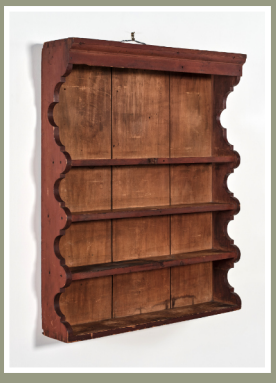
A hanging set of pine shelves with scalloped sides and molded cornice in original red paint. Shown holding some of the Dittmar accessories. Pennsylvania, c.1820 Ht. 35 ¼", W. 28 ¾", D. 6 ½"

Three fine glazed redware spaniels with coleslaw manes and tail att. to George Wagner, Carbon Co., PA, late 19th c. Hts. 9 ½", 7"