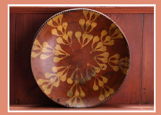
Glazed redware plate with coggled edge and unusual yellow slip decoration. Pennsylvania, c.1830. D. 11 ¾"

Glazed redware charger with yellow slip decoration. Pennsylvania, c.1830. L. 23", W. 16"